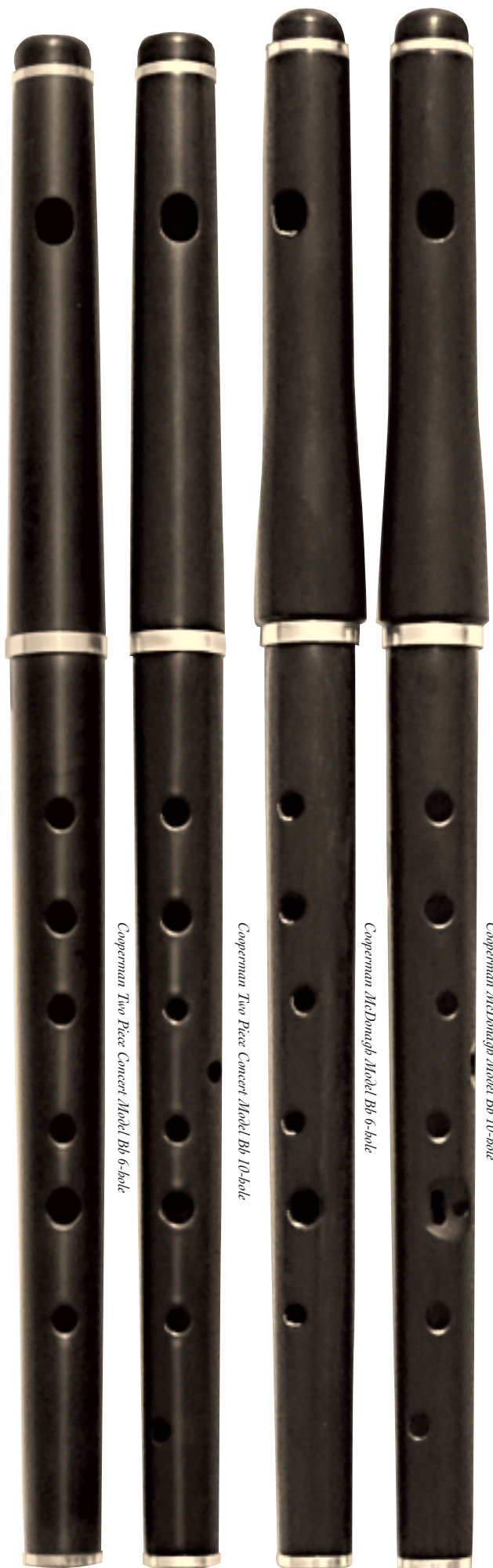
Cooperman Two Piece Concert Model Bb 6-hole

Ten Hole Model The McDonagh model fife features the 6 main tone holes, one of which is doubled with a register hole, plus 2 pinky register holes and 1 thumb register hole.